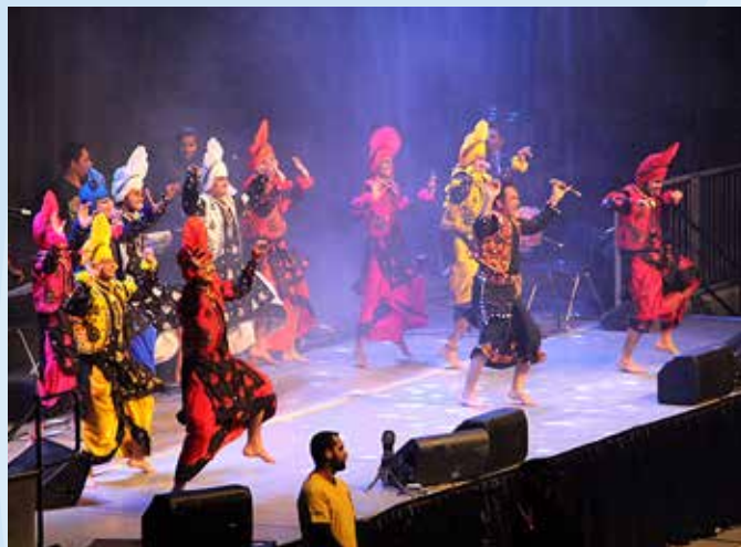
RED FM concert