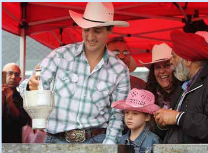
Prime Minister Trudeau and daughter attend our Stampede Breakfast