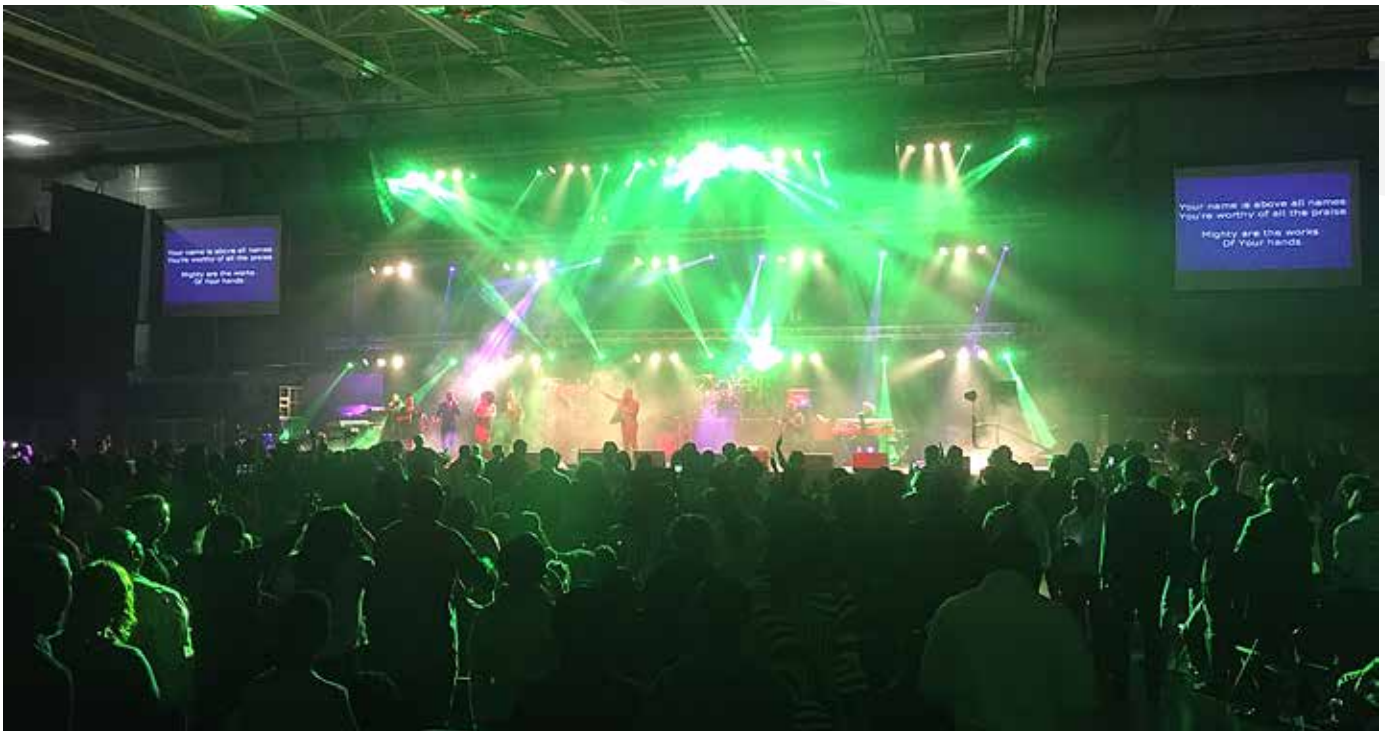
New Year's Eve Celebration