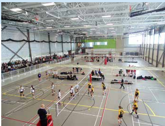
Volleyball tournament in the Feature Gym