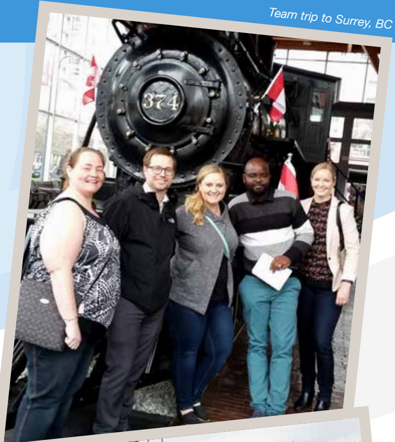
Team trip to Surrey, BC

In 2016 we embarked on the beginning of purposefully engaging our community residents and groups to gain a comprehensive understanding of their needs and strengths. During the year, our team toured the Green Dome Mosque, the Dashmesh Cultural Centre, the Vietnamese Cultural Centre, and met with the leaders of the Gujarati community. In the Fall, we split into two groups and ventured to Brampton, Ontario and Surrey, British Columbia as these municipalities see similar demographic makeup as our catchment area and we took away key learnings on how they engage and empower their diverse communities. We look to grow our cultural competency in 2017 by participating in the Intercultural Development Inventory Program.