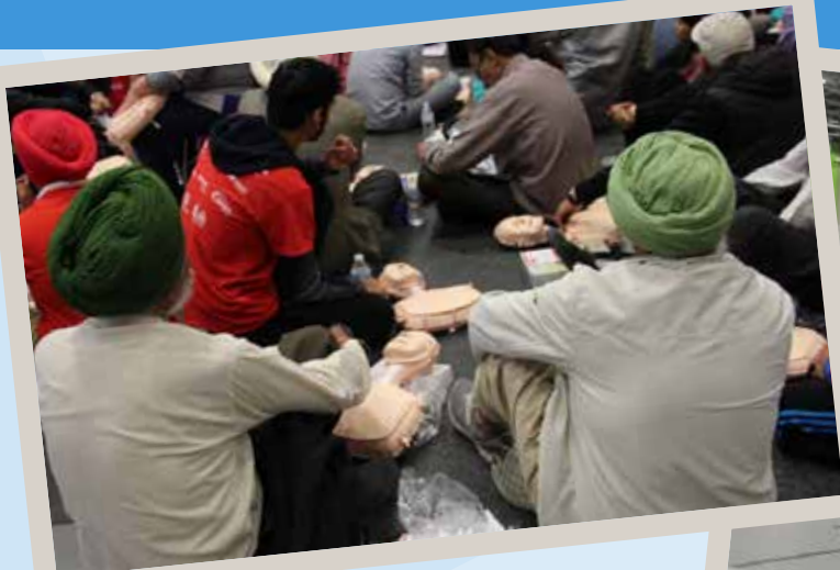
A record number of participants at CPR 500

We believe the future of northeast Calgary will be brighter tomorrow than it is today. Our organization was founded on the principals of serving the most diverse quadrant of Calgary.