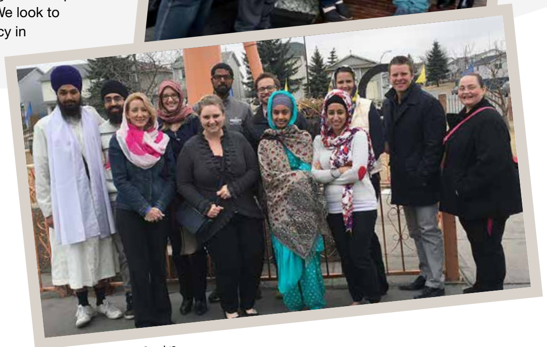
Dashmesh Cultural Centre