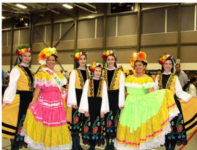
Mexican Dancers at Culturefest