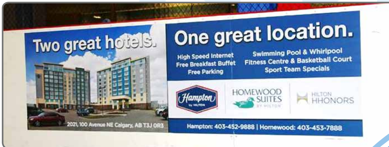
10' x 3' Board Ad Example