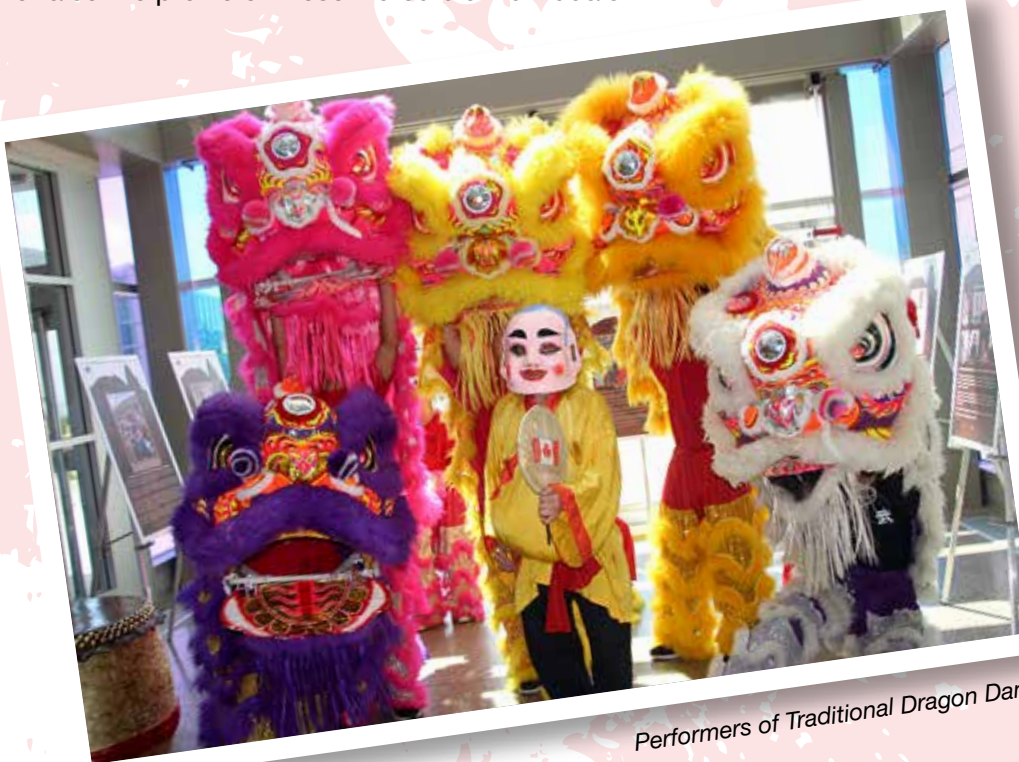
Performers of Traditional Dragon Dance.

It was important for us to partner with an organization that was like-minded, diverse, inclusive and who wanted to collaborate with us in celebrating Asian Heritage Month.