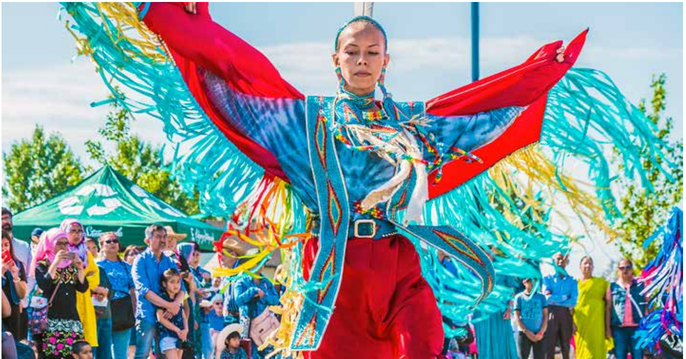
Stampede Breakfast Celebrations 2017