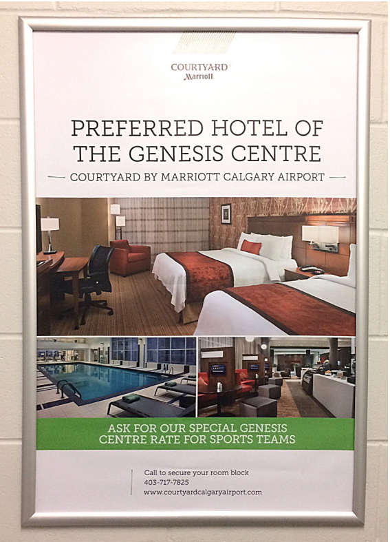
24” X 36” LOCKER ROOM POSTER EXAMPLE