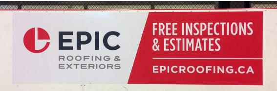
10’ X 3’ BOARD EXAMPLE