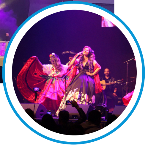
ABOVE: Ranjit Bawa concert | RIGHT: Jessi Uribe concert

While our physical building is a vital resource, we recognize that we can also leverage our facilities in innovative ways. We are eager to explore fresh approaches to utilizing our spaces, from hosting community events to offering novel fitness programs, to maximize our impact on our community.