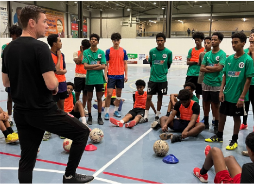
RIGHT: Youth participating in Umoja’s Soccer Without Boundaries drop-in program

For many participants, Soccer Without Boundaries is more than just a weekly activity—it’s a lifeline, a space where they are seen, valued, and empowered. It embodies the very spirit of Genesis Centre: providing opportunities for all, regardless of background or financial means.