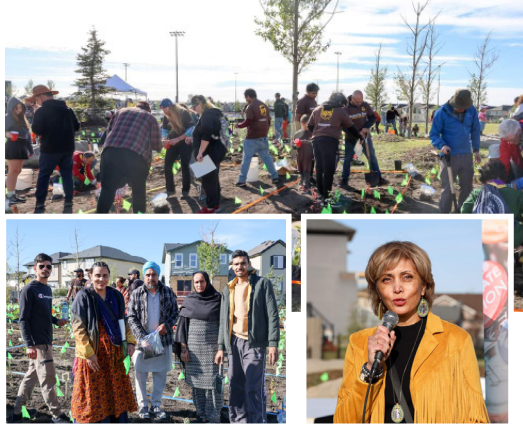
ABOVE: Volunteers partaking in the Tiny Forest Initiative. Mayor Gondek recognizing the efforts of the community.

From fast-paced soccer games indoors to the quiet growth of a new forest outside, Genesis Centre continues to evolve as a place where community thrives in every form—through sport, nature, and the simple act of coming together.