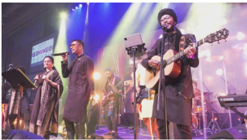
ABOVE: Calgary Indian community celebrates Diwali with food, music, and dances in the Feature Gym.