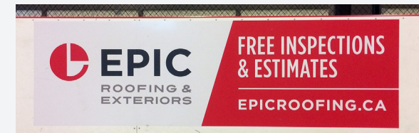
10' X 3' BOARD EXAMPLE

Note: These rates are after a 50% reduction at Little Rock Printing by way of Genesis Centre's preferred vendor status.