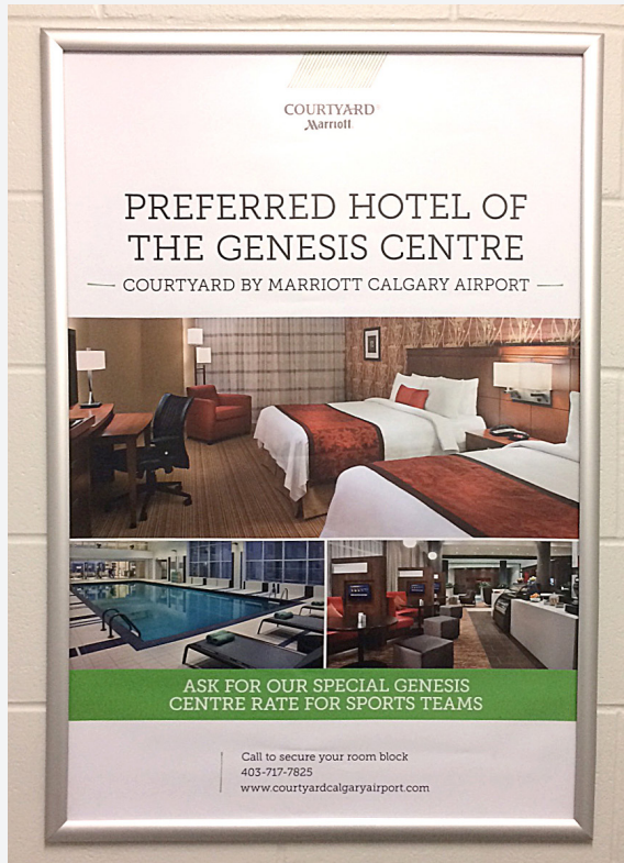
24" X 36" LOCKER ROOM POSTER EXAMPLE